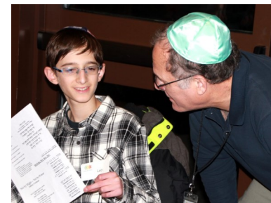
The trivia game was a big hit! A lovely evening for all!