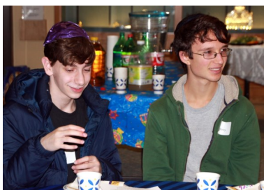
It was the best chocolate gelt I have ever had!