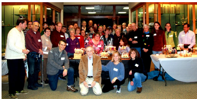
Smiles abound from table to table!