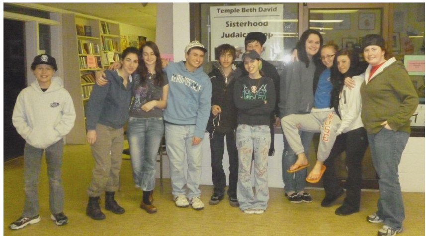
Just part of the crew that helped! Thanks to all!