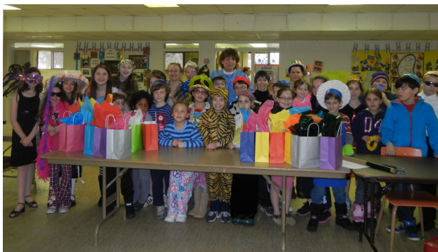
Connecting young and old with Mishloach Manot Baskets