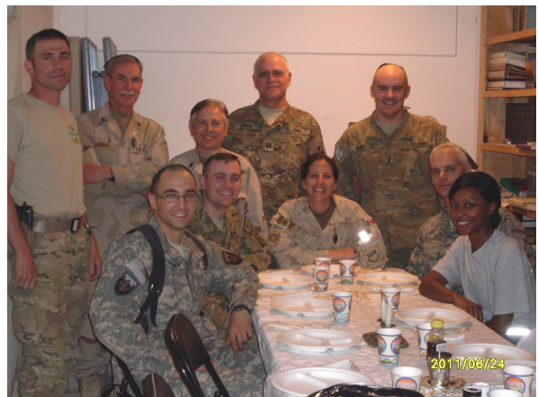
Shabbat in Kandahar