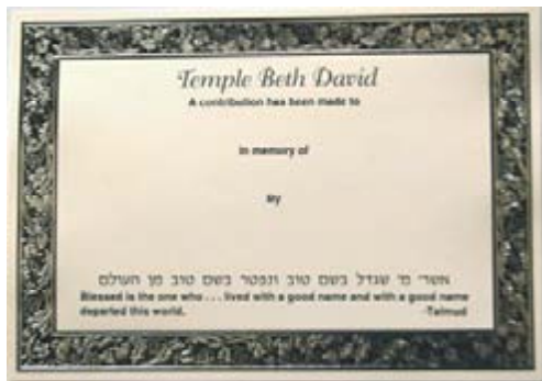
Memorial Card- to whichever fund is designated