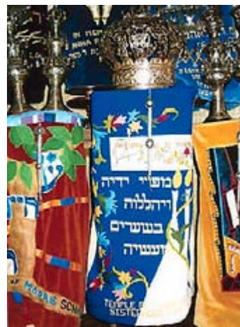
Torah Repair Fund This fund provides for the repair and maintenance of Temple Beth David's Torah scrolls.

Marsha Fishman Education Fund This fund benefits educational programs and expenses for youth at temple.