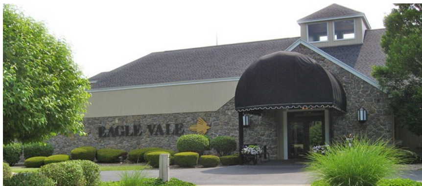
Eagle Vale Golf Course Fairport, NY